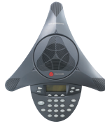
SoundStation® IP 4000

The smallest and most affordable multiperson conference phone. Ideal for offices or small conference rooms.