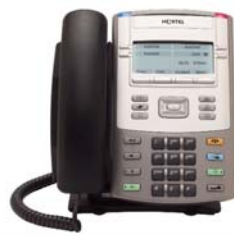
Nortel IP Phone 1120E

And since management can be provided by authorized individuals at the central