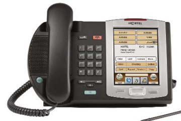
Nortel IP Phone 2007