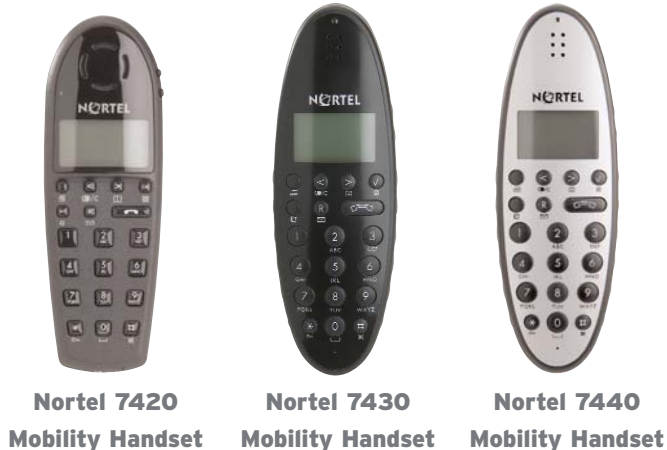
Nortel 7420 Mobility Handset

The Nortel Digital Mobility Deployment Tool makes quick work of getting accurate readings of wireless coverage, so